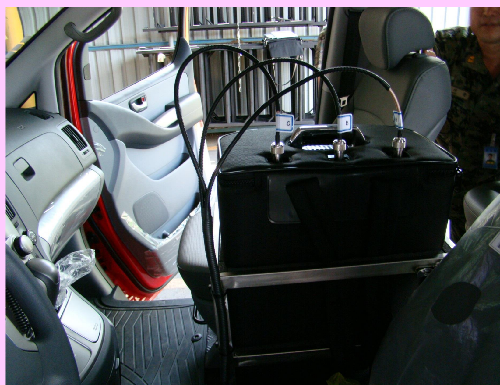
Vehicle Mounted (Optional) Main body in cabin