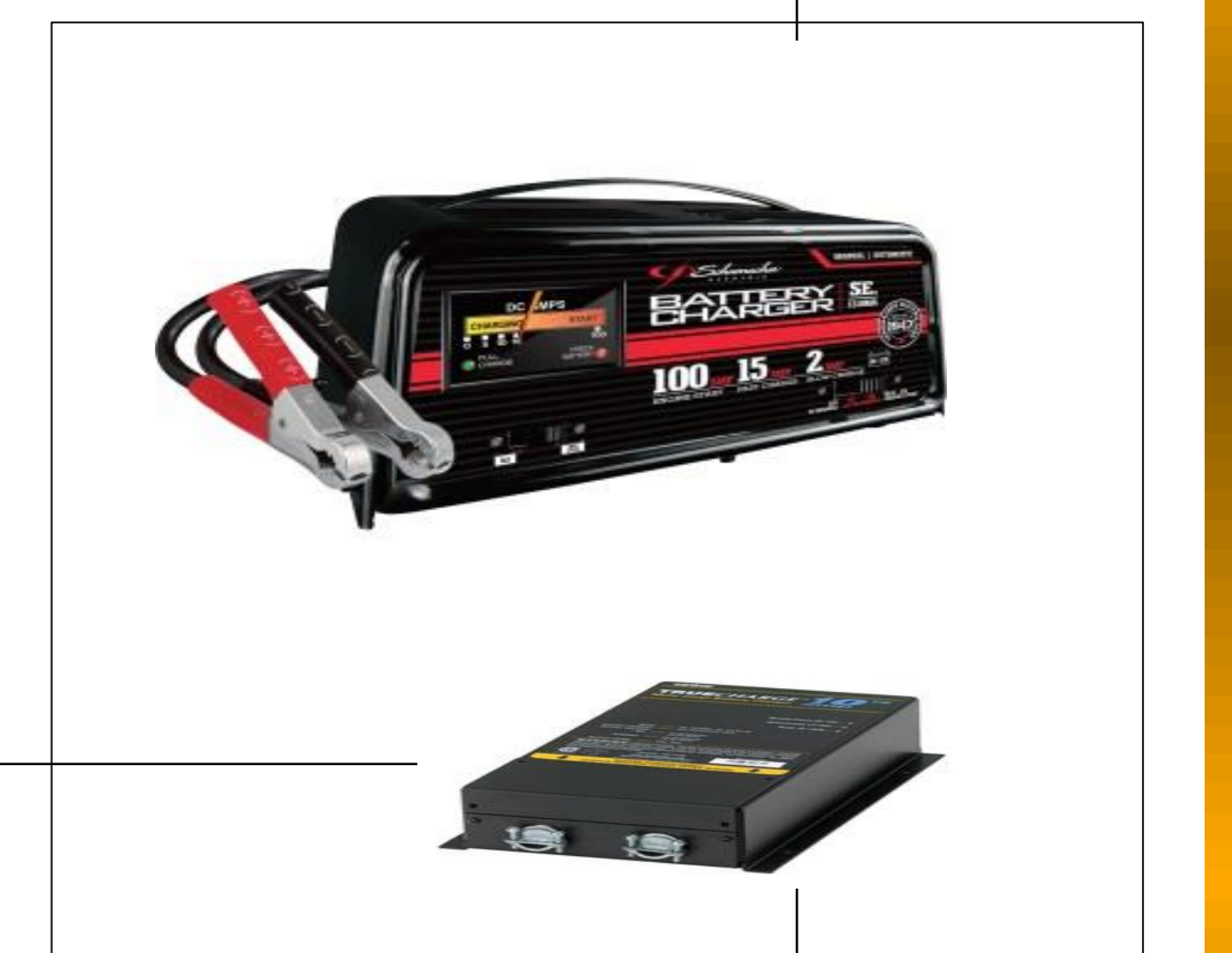
Battery & Battery charger