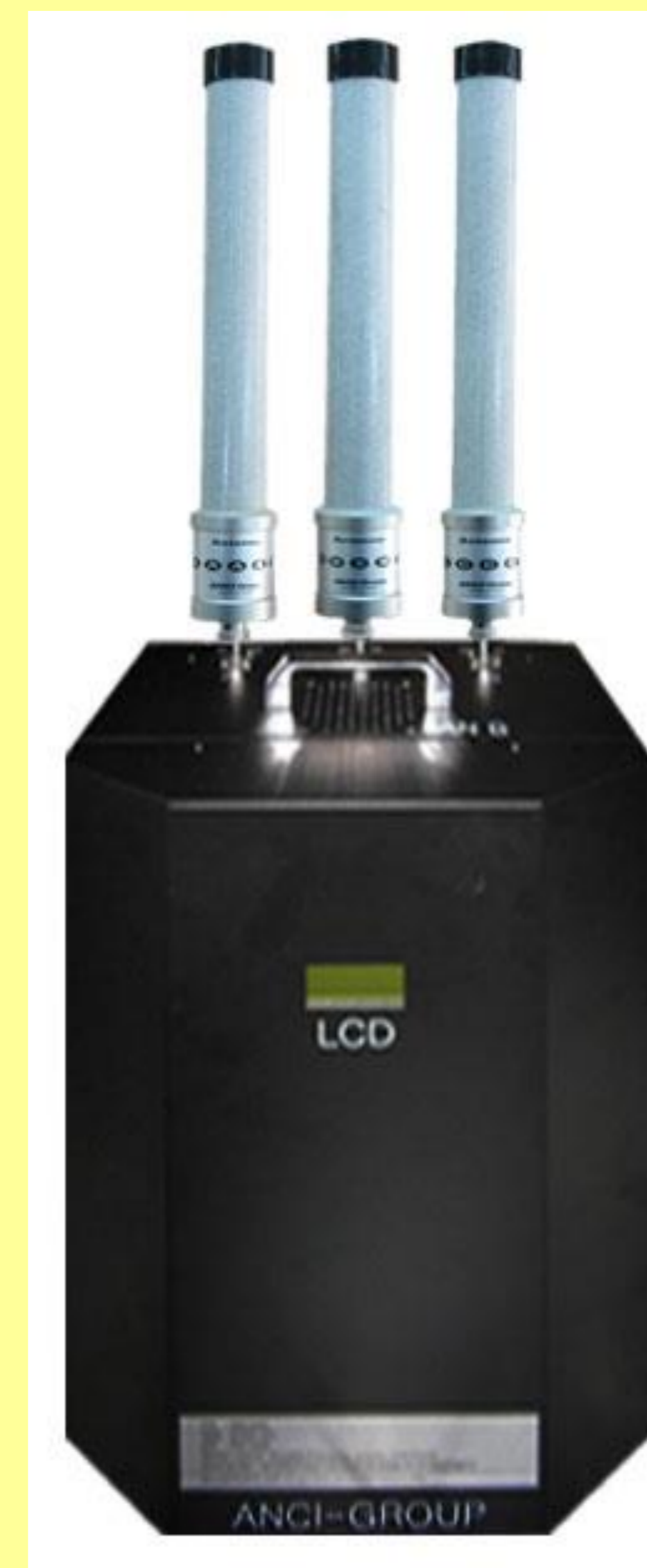
Omni Directional Antennas (3~6 Nos)